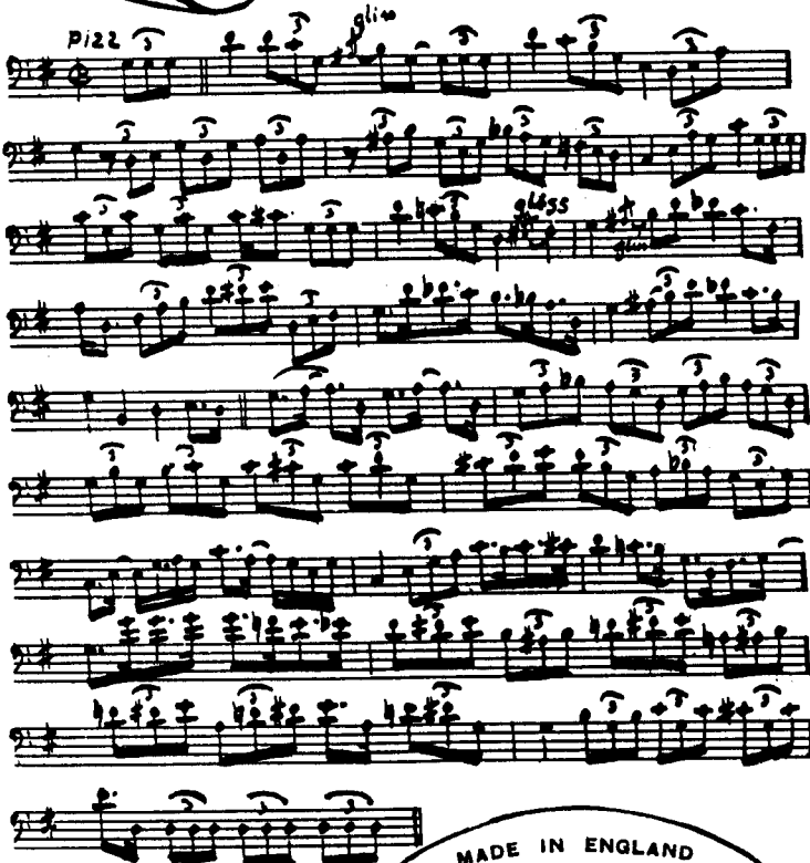
Jimmy Blanton on "BLUES" (22Nov39)

Though there was a test pressing of "MINUET IN BLUES" it was never released in Europe on 78rpm